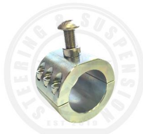
FOX ATS VERSION