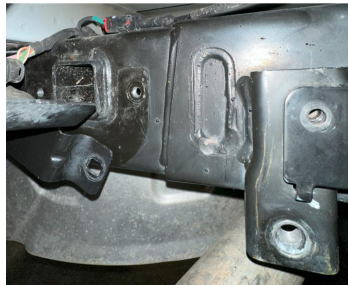
Figure 3: Bolts removed

NOTE: Your vehicle may have a black heat shield installed at this location. You will need to remove and discard the shield, as it will not be reused.