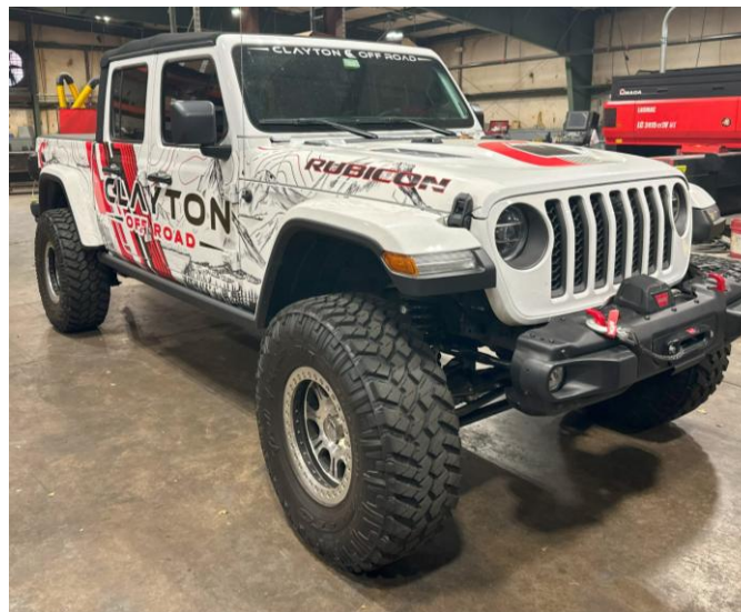
Figure 1: Vehicle parked on flat surface