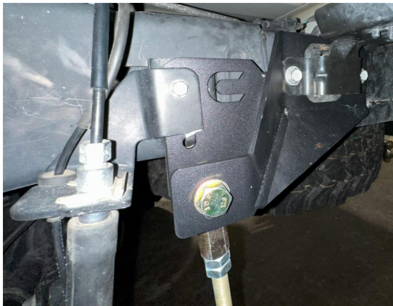
Figure 4: Installed bracket (driver side)

Begin threading the new M12-1.5 x 70mm bolt through the new bracket, sway bar link, and into the PEM on the other side of the original frame bracket. Once a couple of threads are engaged, swing the bracket up and over the square cross member extrusion, and reinstall the frame rail bolts through the holes with the wiring harness bracket mounted over the new sway bar bracket (See Figure 4)