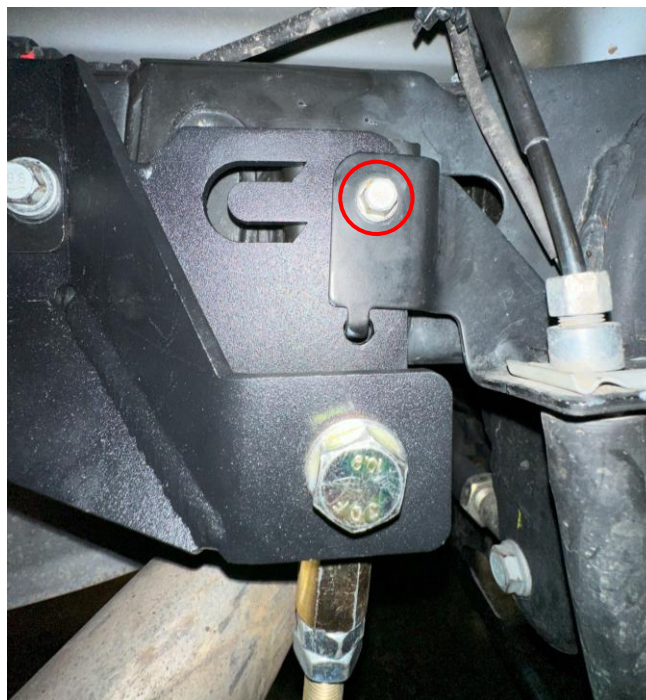
Figure 5: Brake line bracket mounted over “C” wedge plate

Once the mounting bolts are tight, you may reinstall the 10mm bolt with the brake line bracket. Align the key on the bracket to the middle hole on the “C” wedge plate of the bracket, as seen in Figure 5.