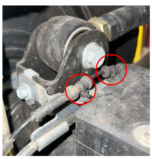
Old ABS zip ties to be removed