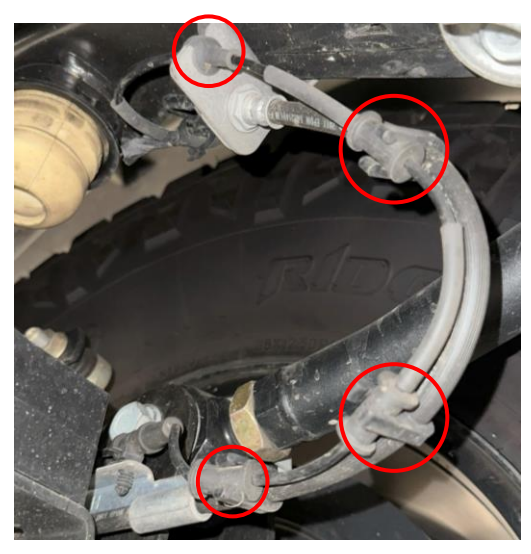
Old ABS clips to be disconnected

The ABS cable should be completely free from the OEM brake line hose. At this point, it should only be connected at the sensor, and past the frame mount.