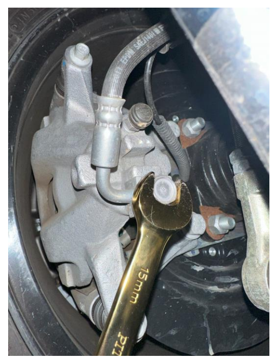
Brake caliper banjo bolt (15mm)

Once the rear brackets (left and right) are in place, you may replace the rear brake lines. You may find it easier to remove the banjo bolt at the caliper first, hang the loose end to avoid a mess, then remove the frame end fitting of the old brake line.