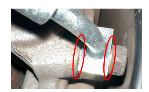
(2) Copper Crush Washers

When reinstalling the banjo bolt, use the new copper crush washers that are included in this kit. Put one washer on either side of the fitting.