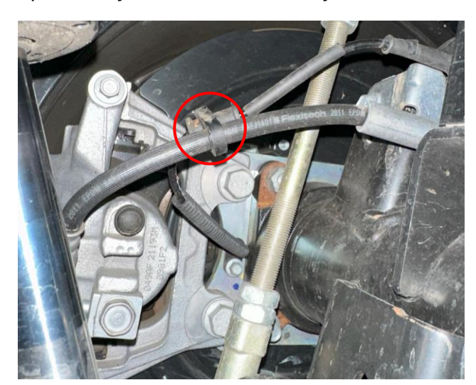
Old ABS clip to be disconnected

Remove all ABS cable clips/zip ties holding the line to the brake hose. This includes the zip ties at the bottom of the upper control arm, the c-clips retaining the ABS line next to the brake hose, and the frame mount. See figures below. Take care when cutting the zip ties so you don't accidentally cut the ABS cable.