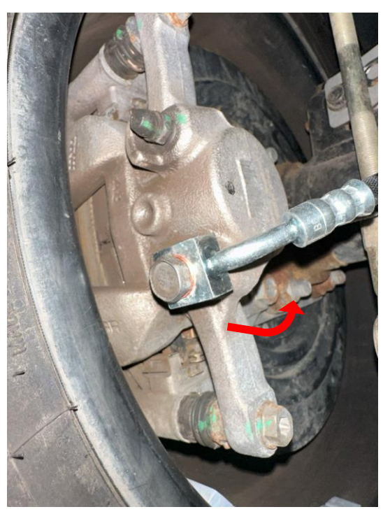
New banjo fitting installed (rear driver's side)

The rear brake lines ARE side specific. Make sure that you match each fitting to its proper side. Reference the photos below. The new banjo fittings included in the kit have a slight bend to them. Ensure this curve/bend of the fitting is pointed in and up towards the axle on both sides. Torque the banjo bolt (15mm) to 26 lbs-ft.