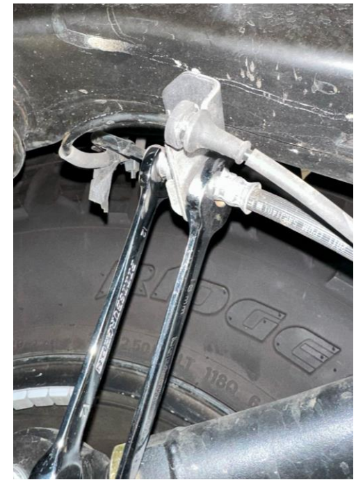
Frame end fitting (16mm and 12mm)

Use rags when removing any brake line fittings to absorb as much brake fluid as possible.