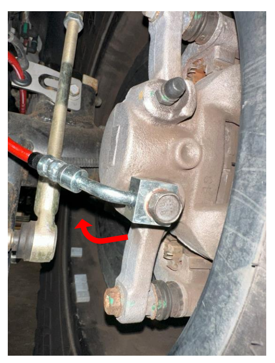
New banjo fitting installed (rear passenger's side)