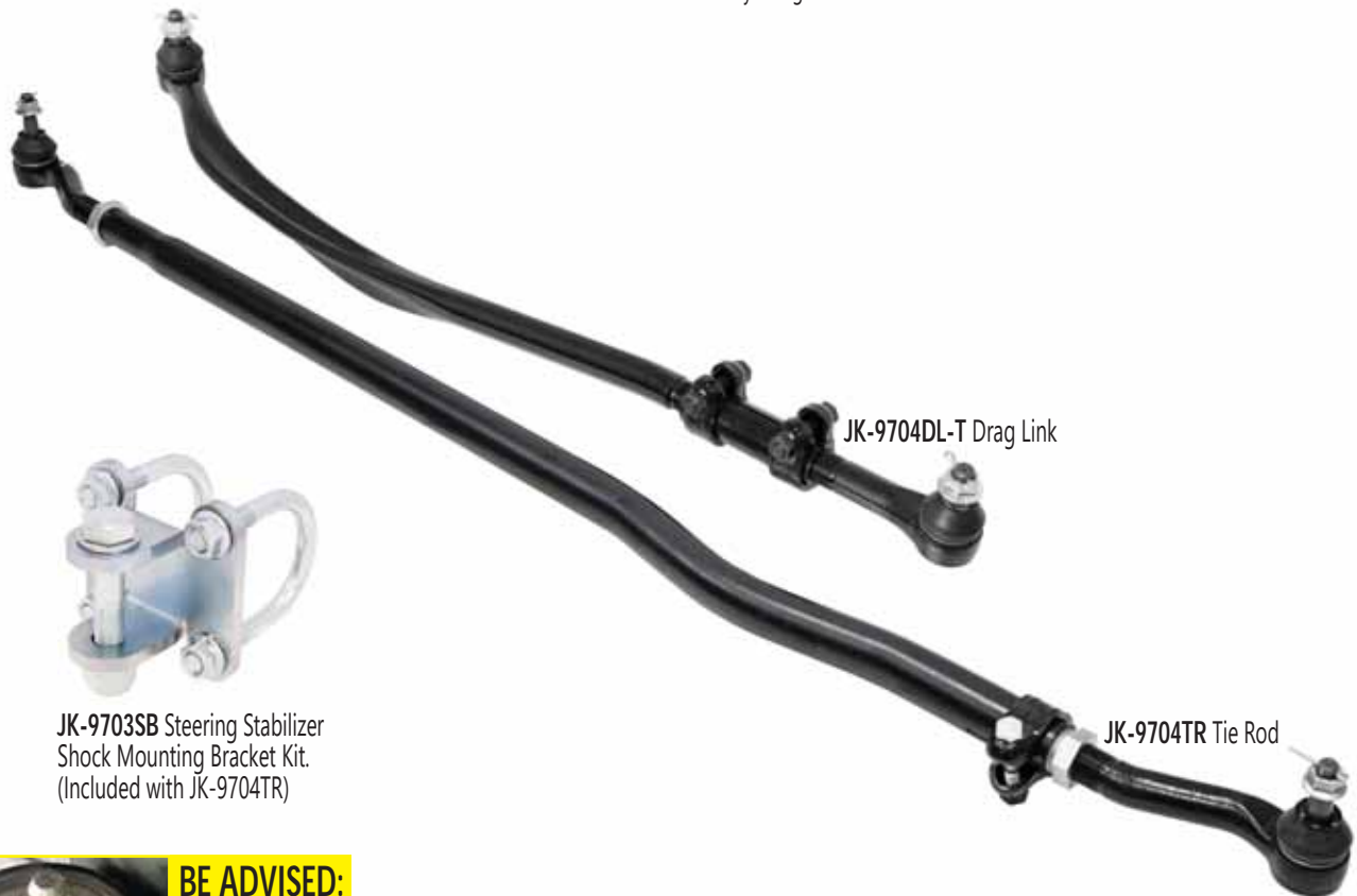
JK-9703SB Steering Stabilizer Shock Mounting Bracket Kit. (Included with JK-9704TR)