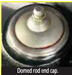
Domed rod end cap.